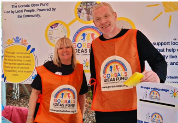
Two GIF Volunteers

The next round of community voting kicks off this August! You'll get the chance to vote for the local ideas you want to see funded. Watch this space for dates, locations, and how to take part—your voice makes the difference!